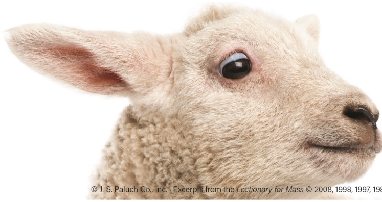
© J. S. Paluch Co., Inc. Excerpts from the Lectionary for Mass © 2008, 1998, 1997, 1986, 1970, CCD. All rights reserved.

John the Baptist saw Jesus coming toward him and said, "Behold, the Lamb of God, who takes away the sin of the world." JOHN 1:29