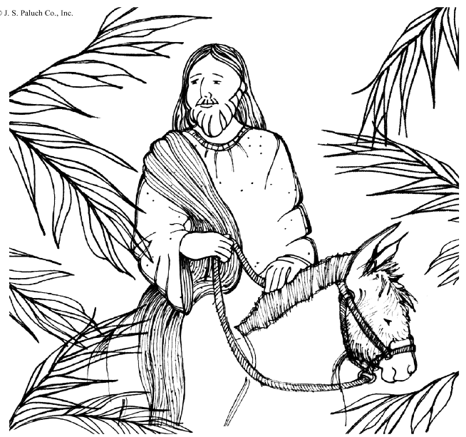
Blessed is he who comes in the name of the Lord.

SAINTS AND SPECIAL OBSERVANCES Sunday: Palm Sunday of the Passion of the Lord Monday: Monday of Holy Week Tuesday: Tuesday of Holy Week Wednesday: Wednesday of Holy Week Thursday: Holy Thursday; Paschal Triduum begins Friday: Friday of the Passion of the Lord (Good Friday); Fast and Abstinence; Income Tax Day; Passover begins Saturday: Holy Saturday; Vigil of Easter